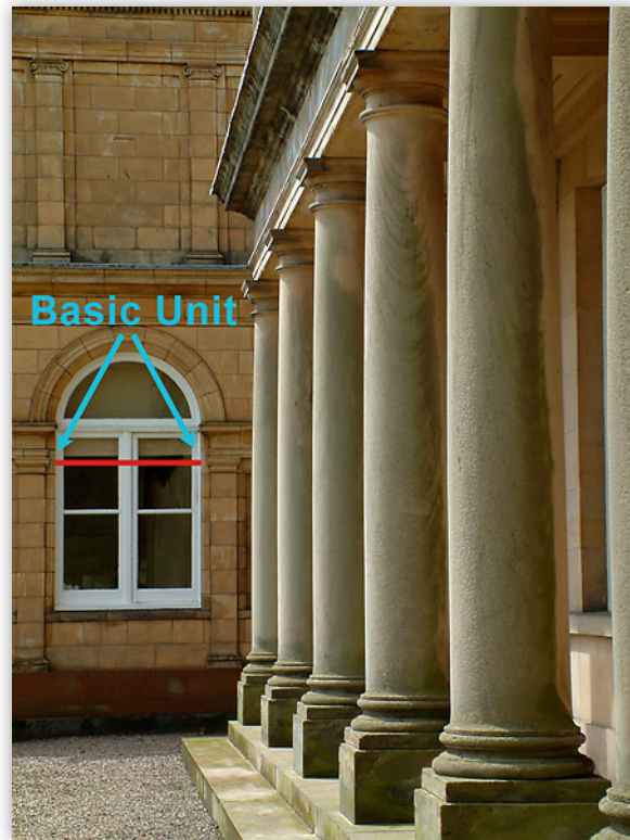
Figure 3. In this subject, the width of the window has been chosen as the Basic Unit for the drawing.

Definition: A basic unit is one single measure from within the subject that is used to assess every other length/width/height in the scene.