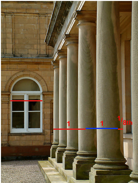
Figure 4 (left). Using the Basic Unit from the window, we can determine the total width of the columns relative to the Basic units. In this case, the total column width is 2\frac{1}{8} basic units.