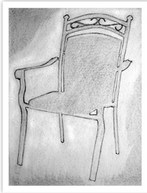
Figure 2. The negative space defines an objects outline

This is one of the best techniques to use for overcoming the tendency of L-Mode to interfere with the process of drawing. If, while drawing, you feel L-Mode ‘getting in the way’ by constantly naming the object or its parts, switch your attention to the negative spaces and draw those instead. You will quickly realise that this is a great way to get through those ‘difficult’ moments of doubt experienced whilst drawing.